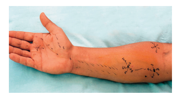
Figure 2. Forearm hypertrophy type "Popeye".