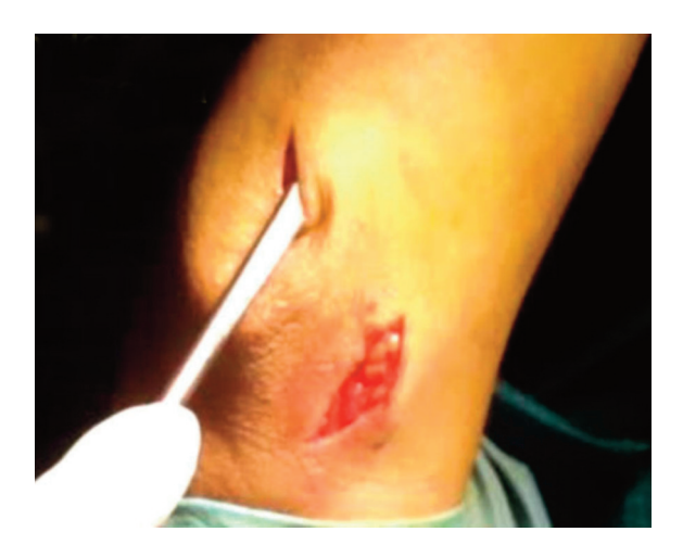
Figure 10. The periostotomo is slid unter the skin on the sides and on the ulnar creste to detach the antebrachial fascia.

We checked 74 cases and 96 interventions, from 2009 to 2015, with a mean follow - up of 3.6 years. Patients were evaluated for 5 parameters BRSS, modified, taking into account the degree of satisfaction, residual pain, recovery of strength, scar, resumption of the previous activities. Results indicate that in over 95% of patients, the surgery was successful.